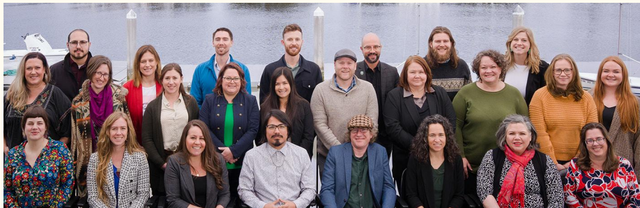
LRC Class of 2023