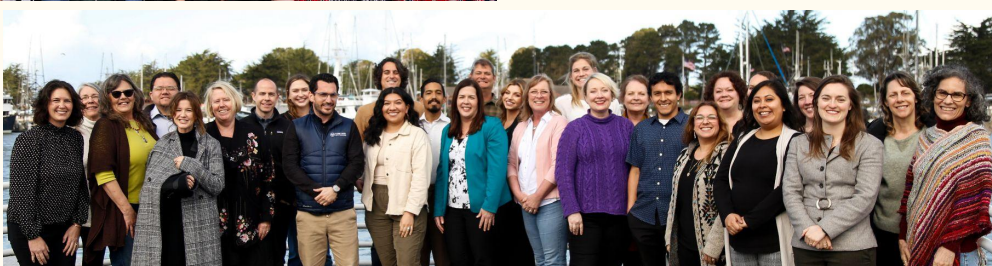
LRC Class of 2024