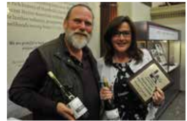
For more December mixer photos visit: www.facebook.com/eurekachamberofcommerce

There is no mixer in January, please join us at the Annual Dinner and Membership Meeting.