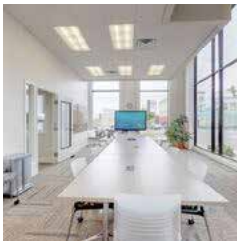
Business HQ

Yes, the vision is a reality! The new Chamber office is now open at 612 G Street in Eureka and includes facilities that can be used by members who need a meeting room, or a large conference room with state-of-the-art technology or simply a means to cost-share expenses like rent, utilities and office equipment. It's a bright yet colorful space, with a welcoming feel. It's also adaptable and flexible.