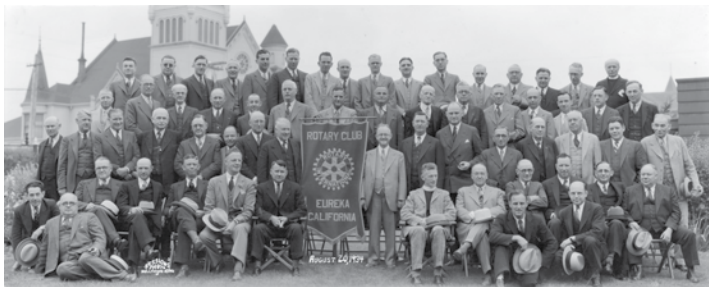
Rotary Club of Eureka members in 1934.